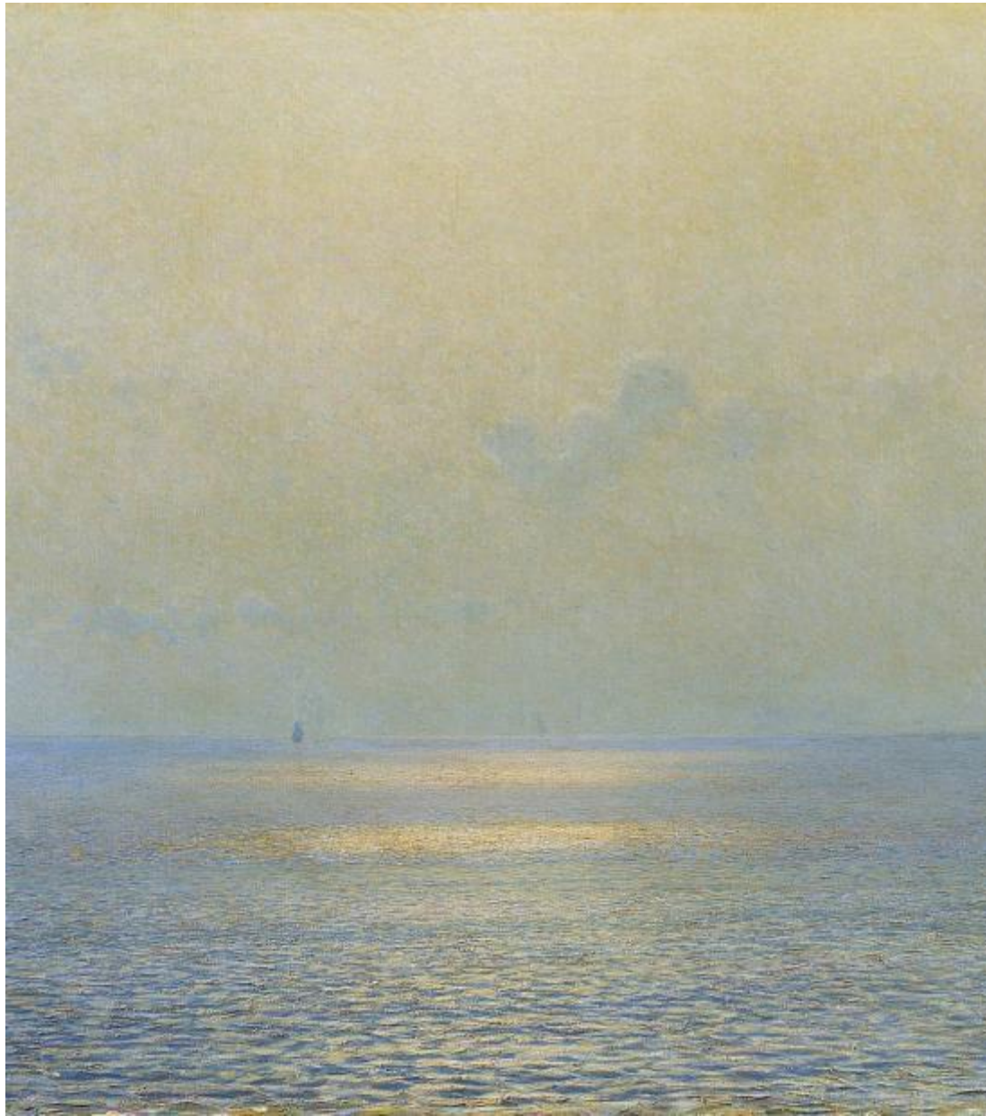
Belloni, Calm (1913)