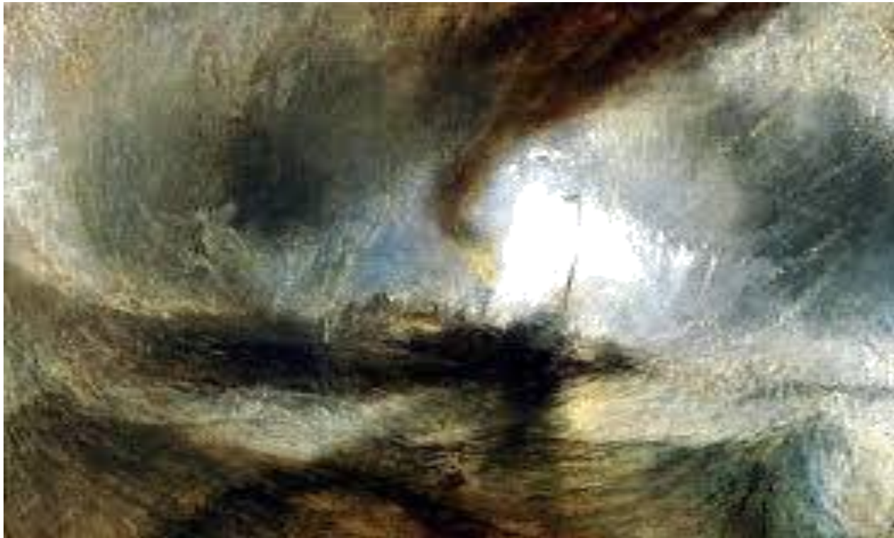
Turner, Snow storm (1842)